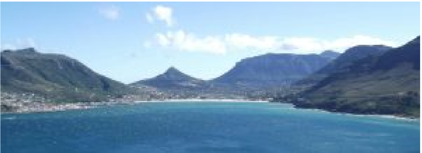
Photo stop by Camps Bay. Visit Hout Bay and enjoy a boat ride to Seal Island (weather permitting).

(Beautiful panoramic view of Hout Bay and the surrounding mountains near Cape Town, South Africa.)